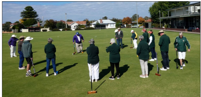
Golf Croquet coaching at Shepparton.

The Coaching Program Introduced in 2021 has now begun its third year and all coaches have been required to attend a coach refresher after two years, only a few coaches still need to attend a refresher. There has been a number of new coaches accredited for various levels in all codes including Gateball.