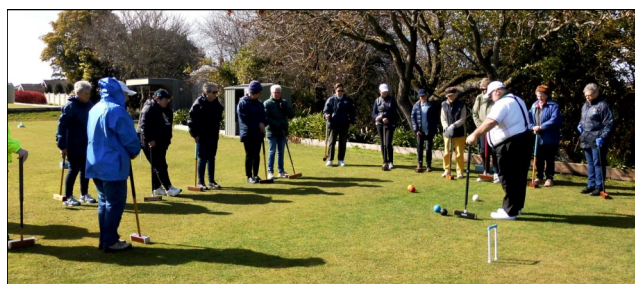
Ricochet Coaching at Hamilton Croquet Club

The past year has seen a National Ricochet Championship at Tempe NSW and some clubs throughout Victoria have held competitive Ricochet Croquet events.