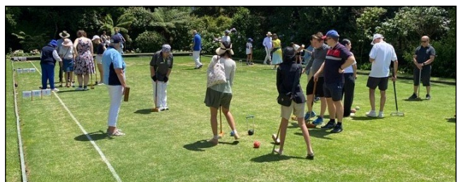
Open Day January 2023 Government House Victoria

Mallet News Victoria -The name change from Malletsports to Mallet News – Victoria was approved in July 2022 by the Committee of Management and this was formally registered (ISSN 265-6447 online) (1-NDU3R39 ASIC) in August 2022. A review of web data revealed 9% of croquet players download Malletsports from the web and 31% looked at some pages without downloading from the web. Marketing & Publicity were guest editors of the first edition (July 2022) of Mallet News. So far it has been unsuccessful in attracting an editor or editors to keep this publication going.