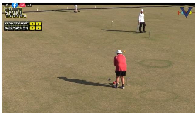
Livestream from Victorian Croquet Centre 13 May 2023

Livestreaming of these five events was funded and organised by Croquet Victoria with Contribution from Croquet Australia for the Australian 2023 Golf Croquet Open Singles.