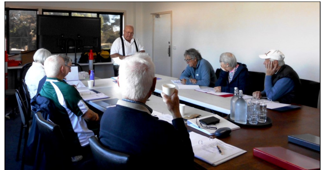
Golf Croquet Handicapping Workshop at Queenscliff.

A Golf Croquet Handicapping Workshop was delivered at the Queenscliff Croquet Club with nine attendees from five clubs. The workshop included a discussion on a skills matrix that assists the Club Handicapper to assign the correct handicap.